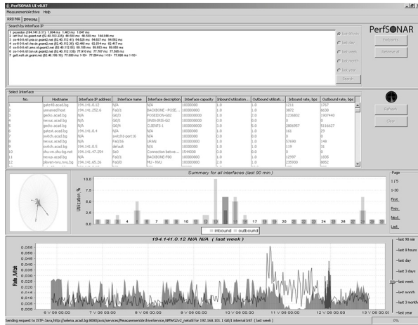
Figure 1 PerfsonarUI RRD MA tab with summaries of successive traceroute hops

One possible scenario for PerfsonarUI usage is searching for interface utilization data at successive traceroute hops in a multi-domain environment and subsequent visualization of summary and detailed statistics for the matched interfaces. Figure 1 depicts PerfsonarUI's output in this scenario.